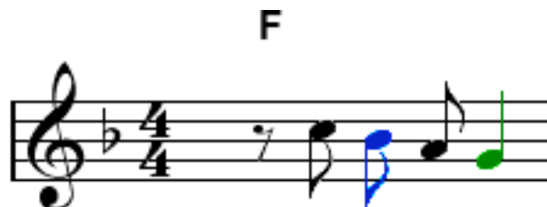
Scale fragment with chord tones off the beat

In playing with scale fragments, it is best if chord tones are hit on the beat rather than off, unless an appoggiatura (from the Italian word appoggiare , "to lean upon") effect is desired. Below is the line from above staggered so that the chord tones are off the beat. While the Bb could be regarded as an appoggiatura , it is not really held long enough to have that effect.