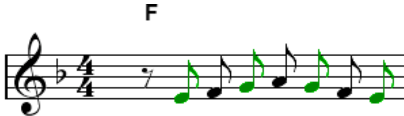
Changing direction in a scale

In using both scales and arpeggios, direction changes during the figure can provide variety and increase interest. Here are a few examples.