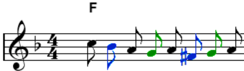
Approach tones (shown in blue)

In the preceding example, the Bb is also ok because it approaches the chord tone a half-step away. This idea is often used to get a “jazzy” sound, even with notes that are not in the scale. Here is an extension of the previous example. Note that the F# is not remotely consistent with the F major chord, but it “works” because it approaches the G, which is a color tone over the F major.