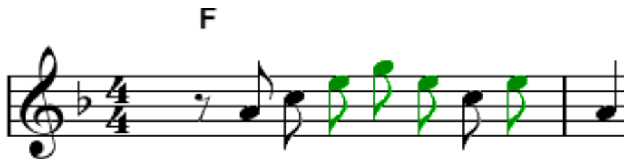
Changing direction (twice) in an arpeggio