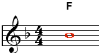
An “avoid note”

“Avoid note” is the jazz player’s term for a note that is in a common scale for a chord, but which shouldn’t be sustained (say longer than an eighth-note) over that chord because it is very dissonant, to the point of sounding harsh. In a way, it is saying that the scale should actually be reduced to a smaller scale in this particular intended use. An example of an “avoid note” is the fourth of a major scale over a major chord. If played in the octave above the chord itself, this note creates a minor-ninth over the third of the chord, which sounds discordant. Short notes of the same pitch are not generally a problem and can be used in passing.